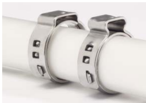
Standard PEX clamp vs. PEXGrip® Clamp