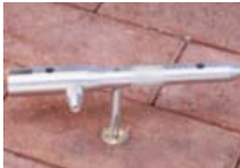
1. Thread anchor with tap