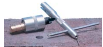
6. Place square tip of stud into tool to remove old anchor from extractor.