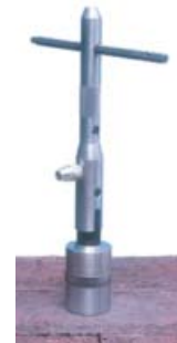
4. Place tool on castle nut and turn clockwise to remove anchor