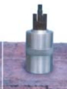
4. Thread castle nut onto extractor.