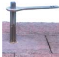
1. Insert tap in pop-up shell to create threads (For threaded shell proceed to 2)