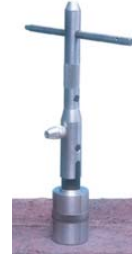
5. Attach tool. Turn clockwise to remove anchor.